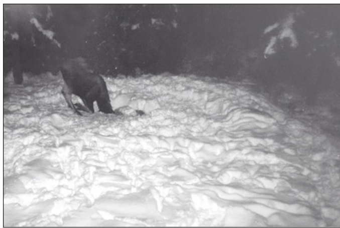
Figure 3. A Moose of unknown sex and age kneels at the study lick in the John Prince Research Forest, North Central British Columbia, February 12, 2003.

Moose utilized the lick regularly in late spring and early summer during each year of this study. Although we could not include the data for the spring/summer of 2004 because of missing date/time imprints on our photographs due to a camera malfunction, our photographic record indicated a large increase in summer use in 2004. With the exception of the first year of this study (2002; a December 2001 peak may have gone unrecorded), Moose utilized the lick regularly during the winter months of December (2004) and January (2003 and 2005)