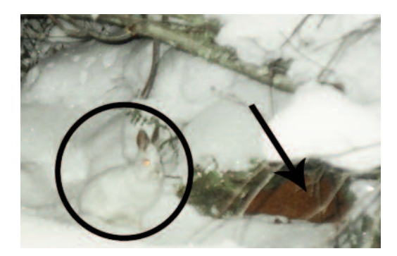
FIGURE 1. Snowshoe Hare ( Lepus americanus ) (circled) photographed at a mineral lick in the John Prince Research Forest, northwest of Fort St. James, British Columbia. The camera was set to take photographs of animals entering and exiting the iron-rich mineral excavation (arrow) over a 1.5-year period (Winter 2004).

Of 348 photographs recorded between late summer 2003 and February 2005, 130 contained images of animals. Of these, Snowshoe Hares were the most often photographed (Figure 1, Table 1). Table 1 details the occurrence of mammals at the site of the excavation. Two Canada Lynx ( Lynx canadensis ) were observed in the winter of 2003, and a pair of Snowshoe Hares was observed in April of 2004.