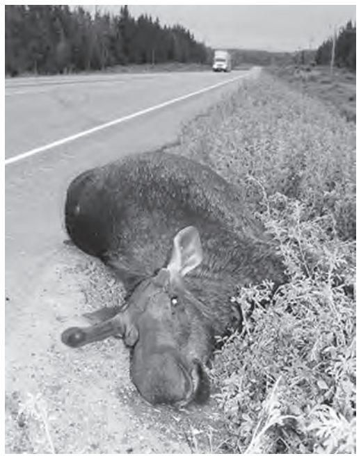
Figure 1. Collisions with Moose continue to be a serious threat to the motoring public in many parts of northern BC. Highway 16 east of Vanderhoof, BC. June 2003.

we have modified a road safety device that utilizes Global Positioning System (GPS) technology to capture date, time, and location using specifically designed waypoint buttons for deer (Odocoileus spp.) and Moose (Alces alces), which are the most commonly observed large animals on roads in northern BC. Ten units are currently deployed in trucks that ferry goods back and forth along designated routes in northern BC several times a day. When a truck driver observes a Moose or deer in the road corridor, he or she depresses the appropriate button to record a waypoint of that animal. If the deer or Moose observed is dead, the trucker depresses a "dead" button on the unit quickly after selecting the Moose or deer button. Location, date, and time of day as well as species and whether or not the animal is dead are recorded in the unit's memory. Twice per month, data are downloaded by company dispatchers and e-mailed to our research team at the University of Northern BC where it is uploaded into GIS mapping